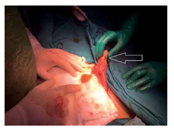
Figure 5. Photographs of perioperative Meckel's diverticulum perforation