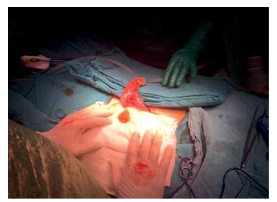
Figure 4. Photographs of perioperative Meckel's diverticulum